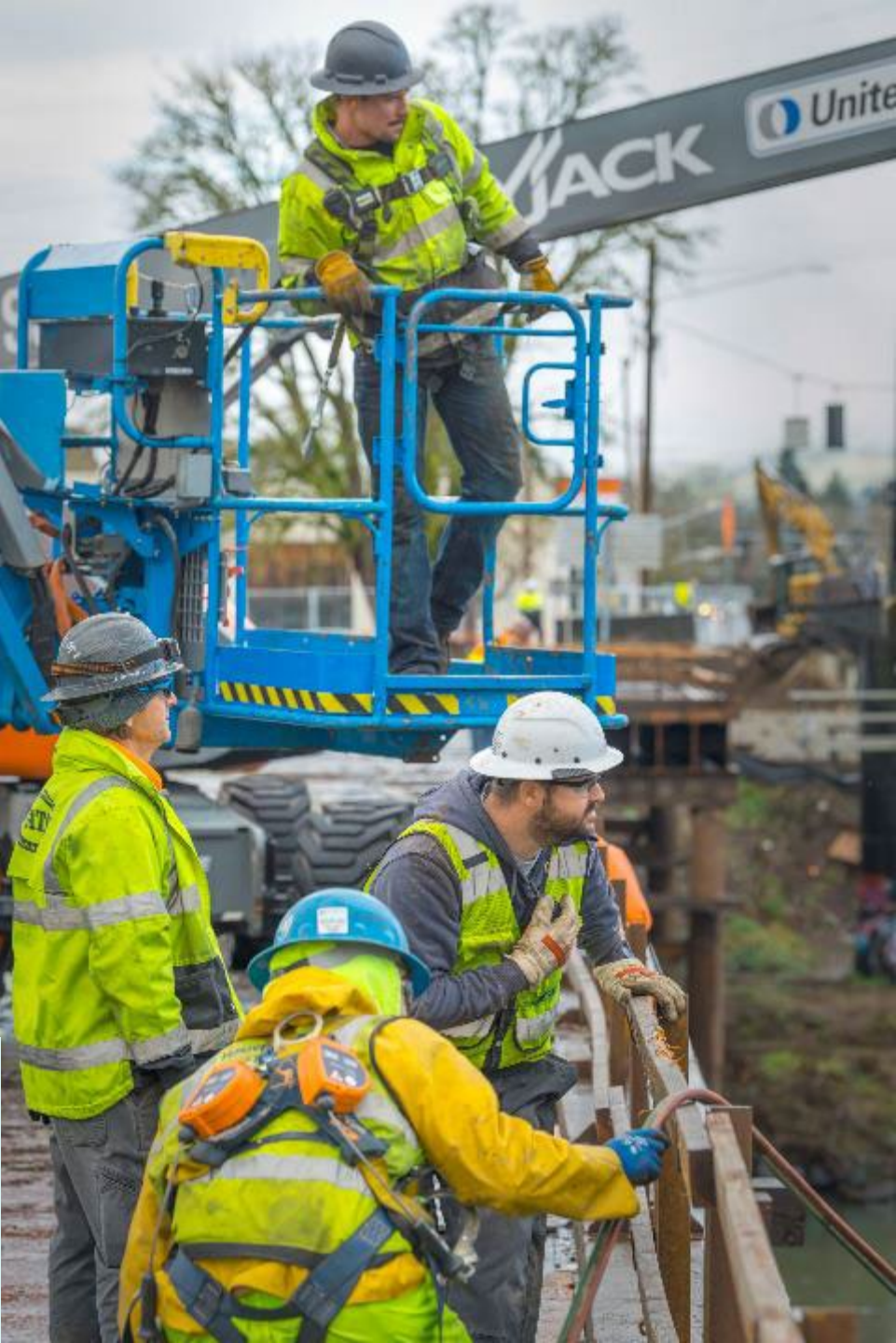
Region 2 – OR34: Van Buren Bridge (Corvallis)