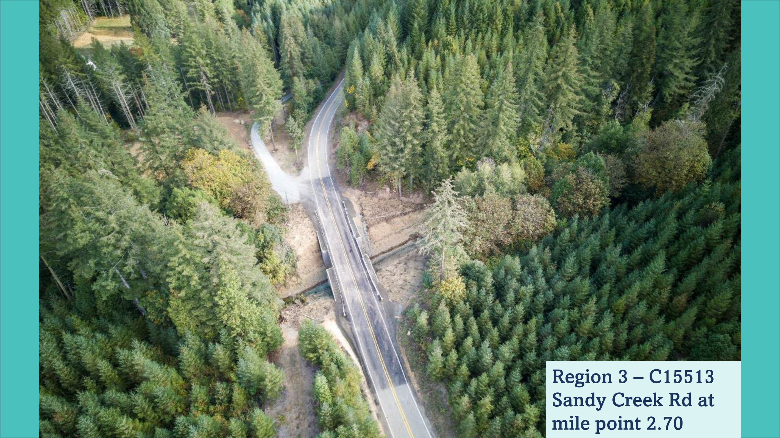
Region 3 – C15513 Sandy Creek Rd at mile point 2.70